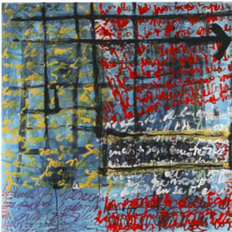
DESOLATION. 2018 Acrylic on Canvas 59 x 59 in

Reasoning about the incomprehensible. The letters are clear what it is incomprehensible is the human mind.