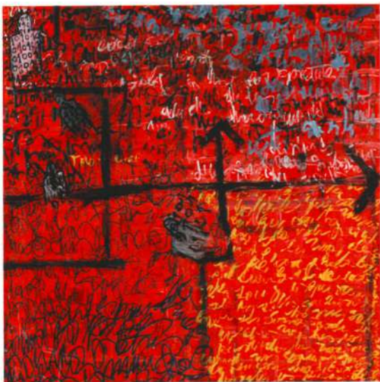
ANGUISH. 2018 Acrylic on Canvas 59 x 59 in

...And They said to each other, “Come, let’s make bricks and bake them thoroughly.” They used brick instead of stone, and tar for mortar. 4 Then they said, “Come, let us build ourselves a city, with a tower that reaches to the heavens, so that we may make a name for ourselves; otherwise we will be scattered over the face of the whole earth.” Genesis 11: 3-4