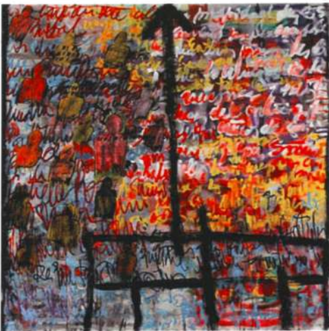
MISCOMUNICACION. 2018 Acrylic on Canvas 59 x

2- DESOLATION – LEFT ALONE. Confusing mankind with twisted languages as punishment for their pride